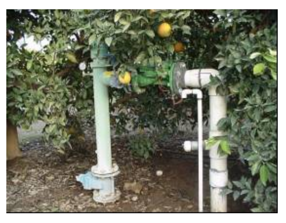
Figure 3. Automatic valve on a farmer turnout to shutoff deliveries before 12_pm and turn them back on after 6_pm.

The first project was fully operational during the 2002 peak season (June-September) curtailing 637 kW of peak load (Monday-Friday, 12 pm-6 pm). This represents 510 kW of load reduction by the district and 127 kW of load reduction from water users in the district. The second project was completed prior to the 2003 peak season and curtailed an additional 126 kW of peak load, which represents 101 kW from the district and 26 kW from water users within the district.