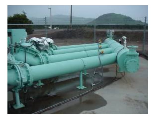
Figure 2. Pump station discharge outlet with new flow meters (yellow).

OCID also instituted a landowner load reduction program, whereby individual growers signed up with OCID to commit to a kW reduction during the peak period. In return, the district reduced the price of water for the growers.